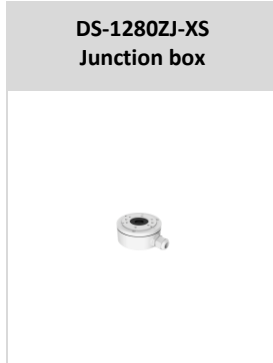
DS-1280ZJ-XS Junction box